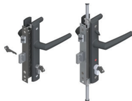
Exclusive Killara furniture with 4 point locking and snib release