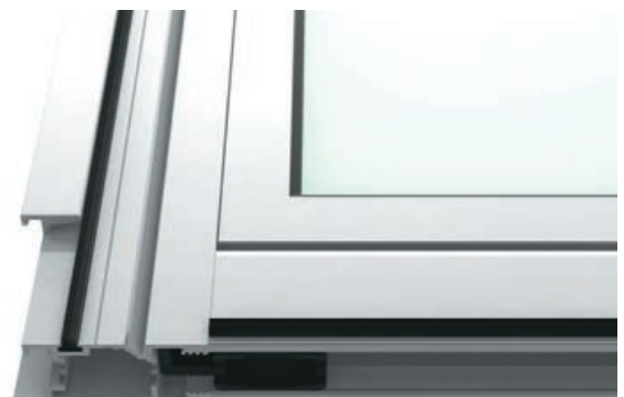
Stainless housing commercial grade rollers for all glass options.

The entire Carinya Collection has been fully tested to meet or exceed Australian Standards AS2047, AS1170, AS1191 and AS3959.