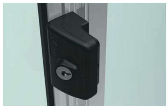
Exclusive proprietary handle for ease of operation with optional colour finishes.