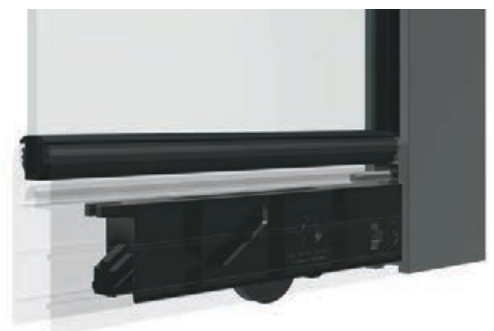
Alspec's high performance, commercial door roller used in the Carinya residential sliding door for smooth operation.

The entire Carinya Collection has been fully tested to meet or exceed Australian Standards AS2047, AS1170, AS1191 and AS3959.