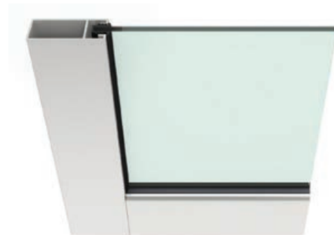
58mm wide rails and stile.