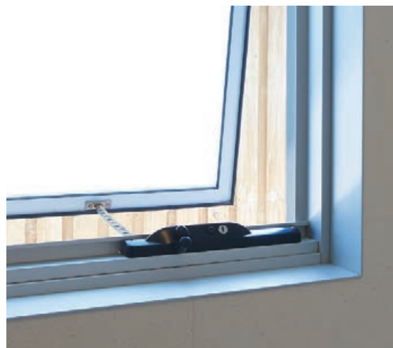
Chain winder with optional sash restriction.